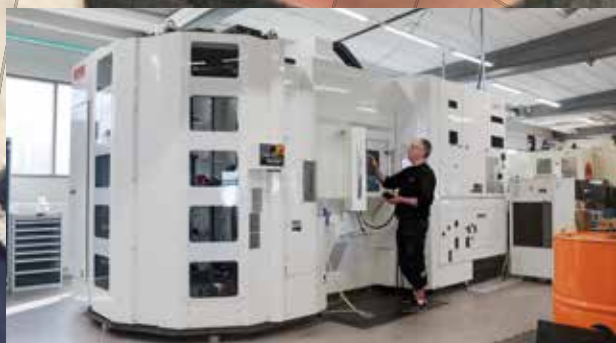
One of our two Yasda Px30i machines, a 5-axis precision machine with integrated automation.

"With 50 years of experience in complex machining, we bring specialist expertise in cutting and EDM processes to the MF Group. We have a passion for production technology and can tackle the most challenging components – feel free to put us to the test!"