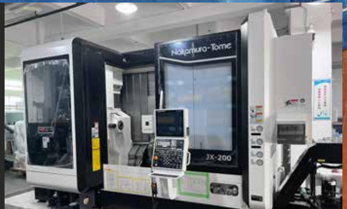
Our latest investment in 2024: a multi-operation lathe with a B-axis, turret, and bar feeder.